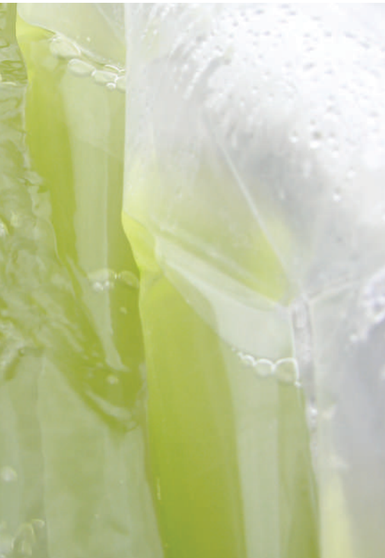
Green gold: algae could produce biodiesel much more efficiently than conventional crops.